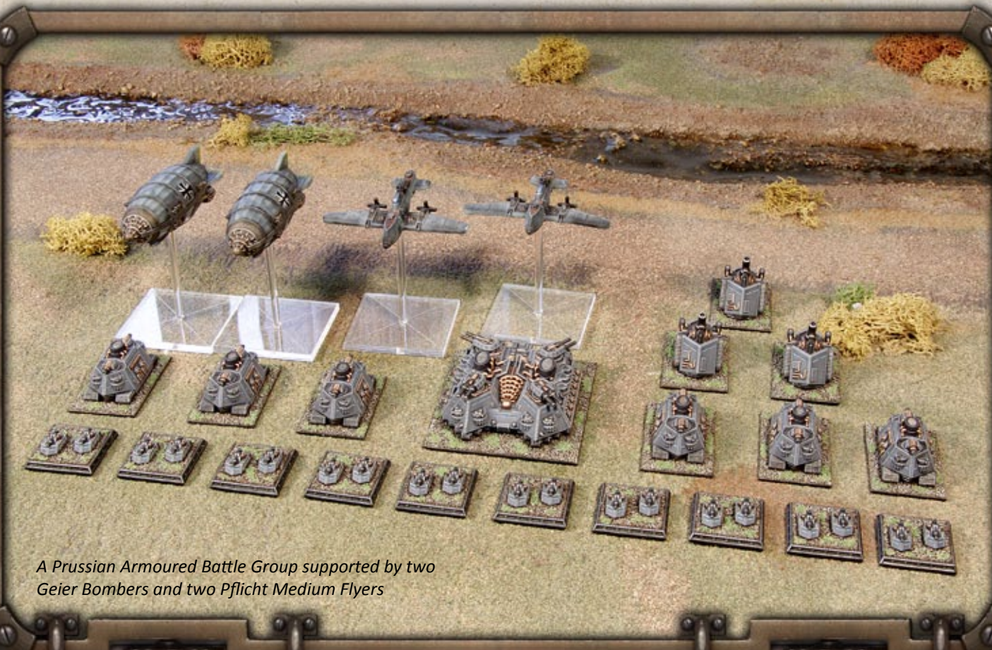
A Prussian Armoured Battle Group supported by two Geier Bombers and two Pflicht Medium Flyers

In addition to the models we have also included acrylic bases pre-cut to work with your vehicles, and four A5 laminated token sheets give you all the counters you need to easily integrate the models with your existing Dystopian Wars armies.