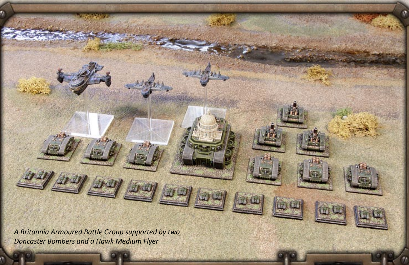
A Britannia Armoured Battle Group supported by two Doncaster Bombers and a Hawk Medium Flyer

In addition to the models we have also included acrylic bases pre-cut to work with your vehicles, and four A5 laminated token sheets give you all the counters you need to easily integrate the models with your existing Dystopian Wars armies.