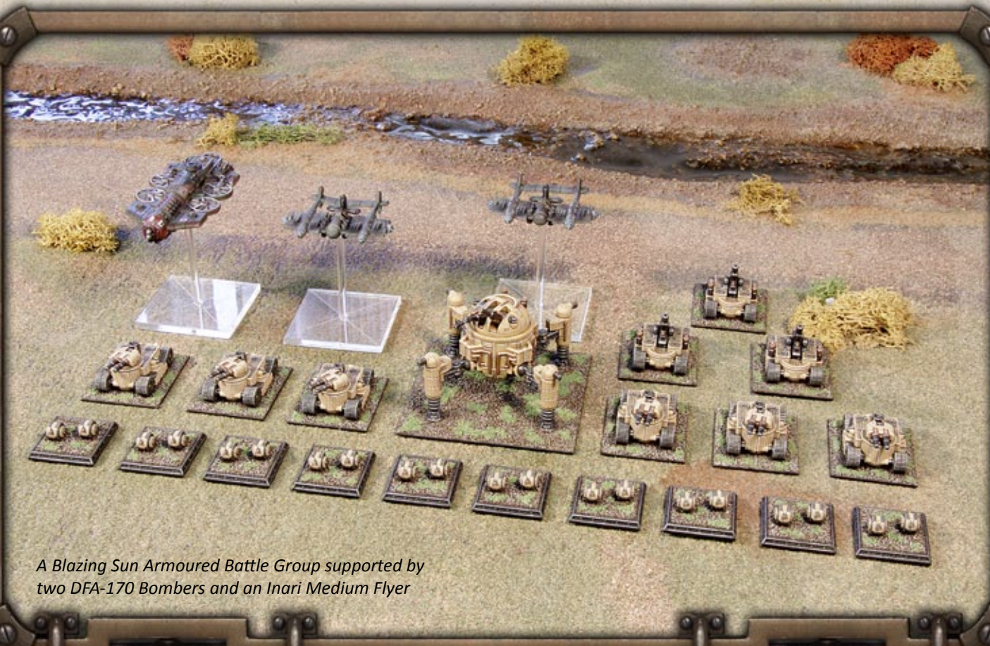
A Blazing Sun Armoured Battle Group supported by two DFA-170 Bombers and an Inari Medium Flyer

In addition to the models we have also included acrylic bases pre-cut to work with your vehicles, and four A5 laminated token sheets give you all the counters you need to easily integrate the models with your existing Dystopian Wars armies.