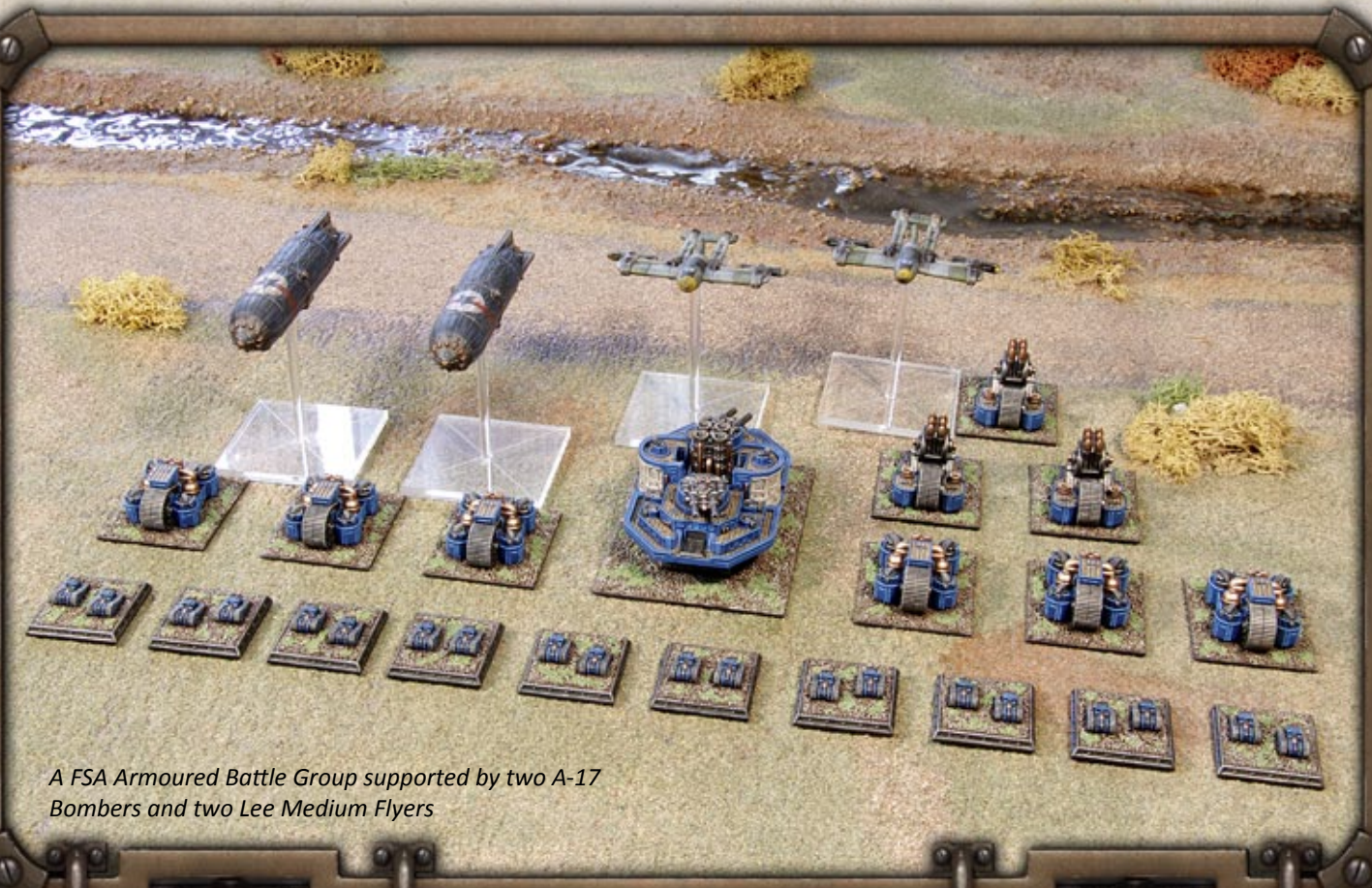
A FSA Armoured Battle Group supported by two A-17 Bombers and two Lee Medium Flyers

In addition to the models we have also included acrylic bases pre-cut to work with your vehicles, and four A5 laminated token sheets give you all the counters you need to easily integrate the models with your existing Dystopian Wars armies.